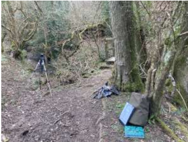
Stream survey and soundscape recording Culver Brook

Started soundscape recording at Cutteridge and alongside stream surveys