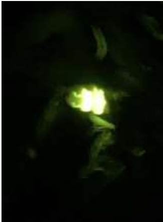
24/06/21 glow worm