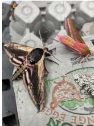
Elephant Hawk Moth & Privet Hawk Moth