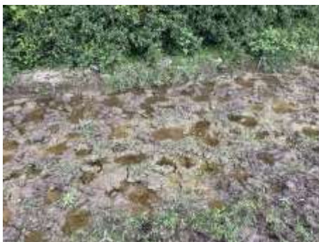
Section near shed still v wet but path across field drier and tractor seems to be using field parallel to path