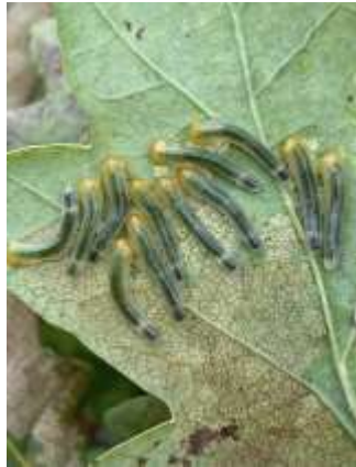
Oak slug sawfly