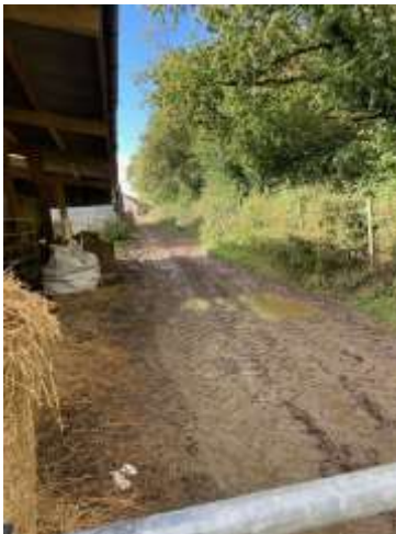
After prolonged dry spell