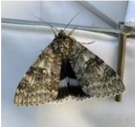
Clifden nonpareil moth