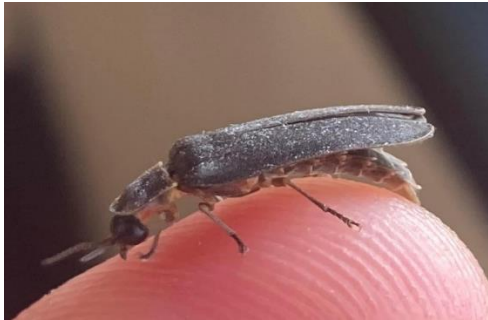
Male Glow worm.